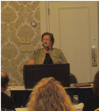
Judge Li Nelson