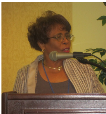
Justice Peggy Quince